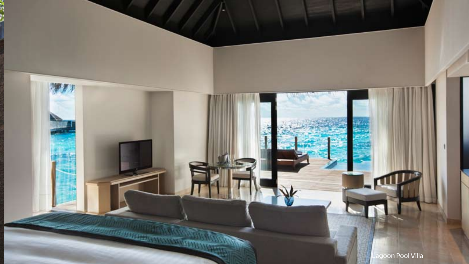
Lagoon Pool Villa