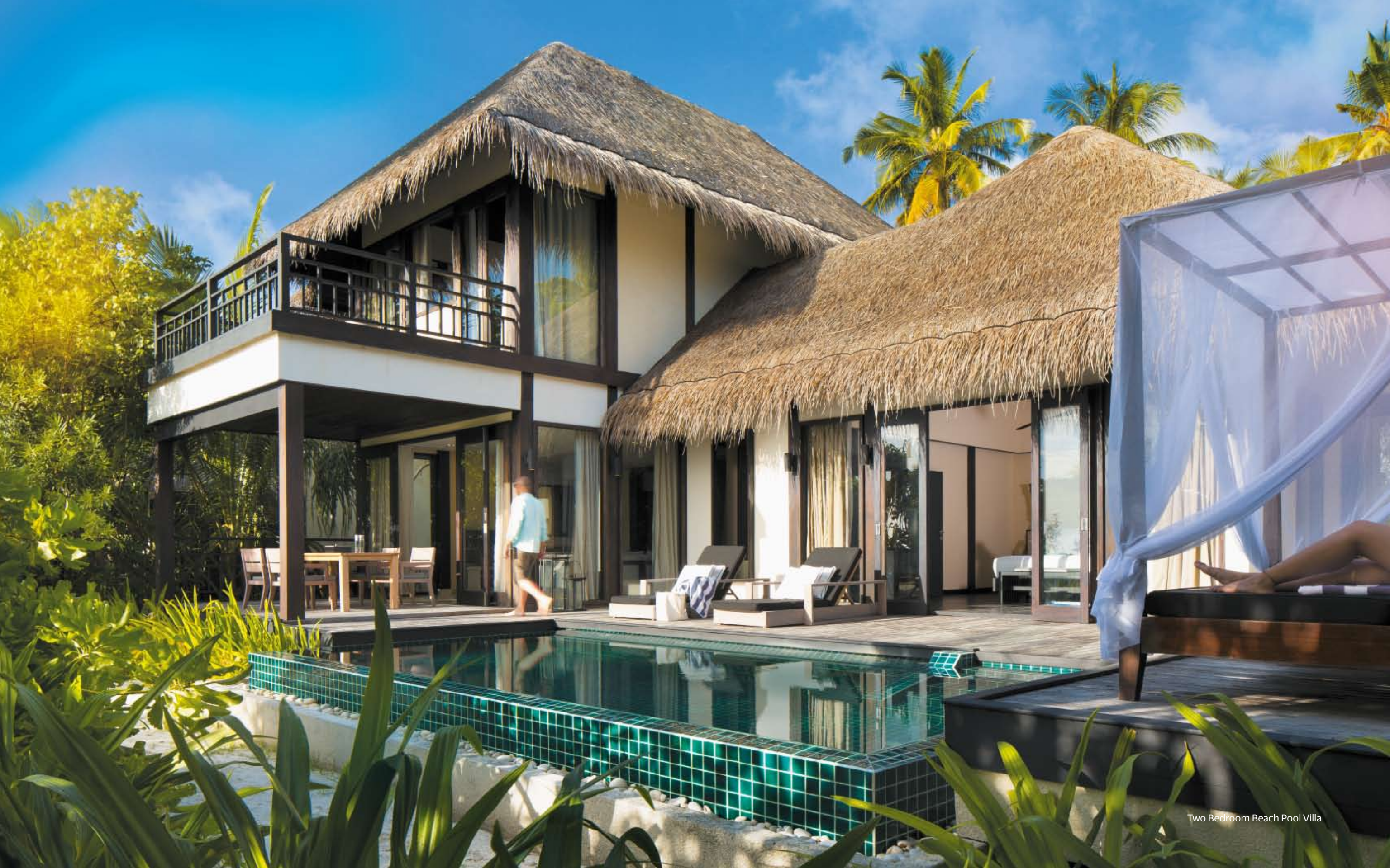
Two Bedroom Beach Pool Villa