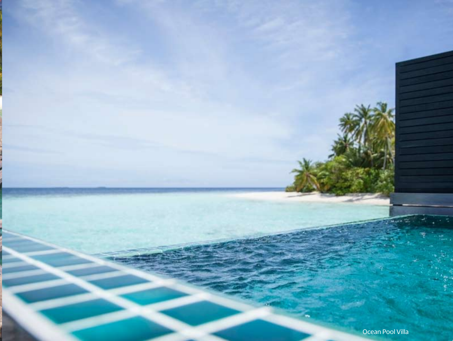
Ocean Pool Villa