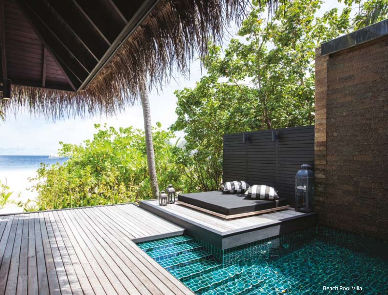
Beach Pool Villa